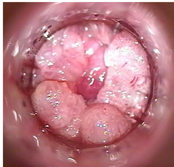
Figure 1 Before Topical 5-FU.